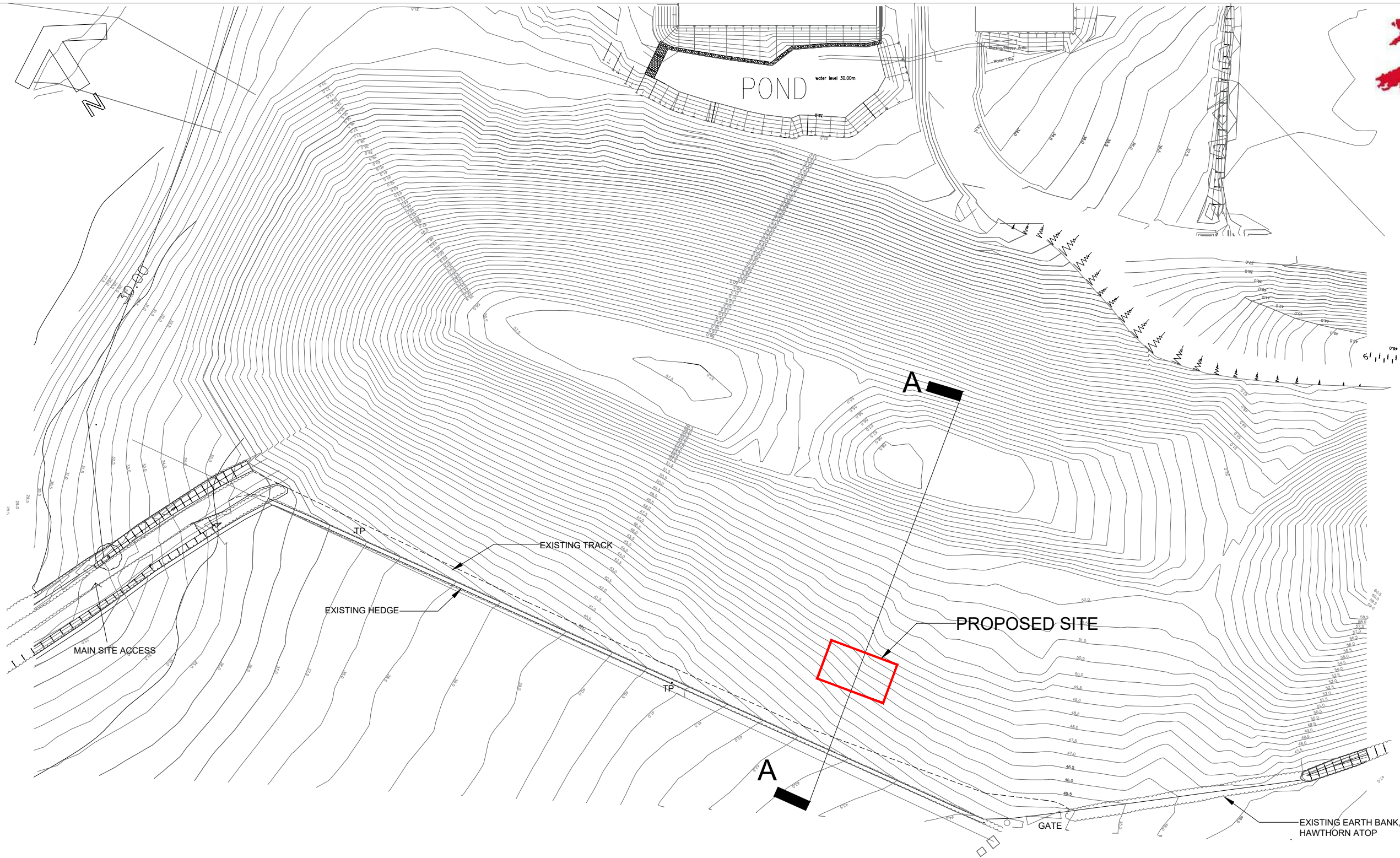
EXISTING BLOCK SITE PLAN 1:1250