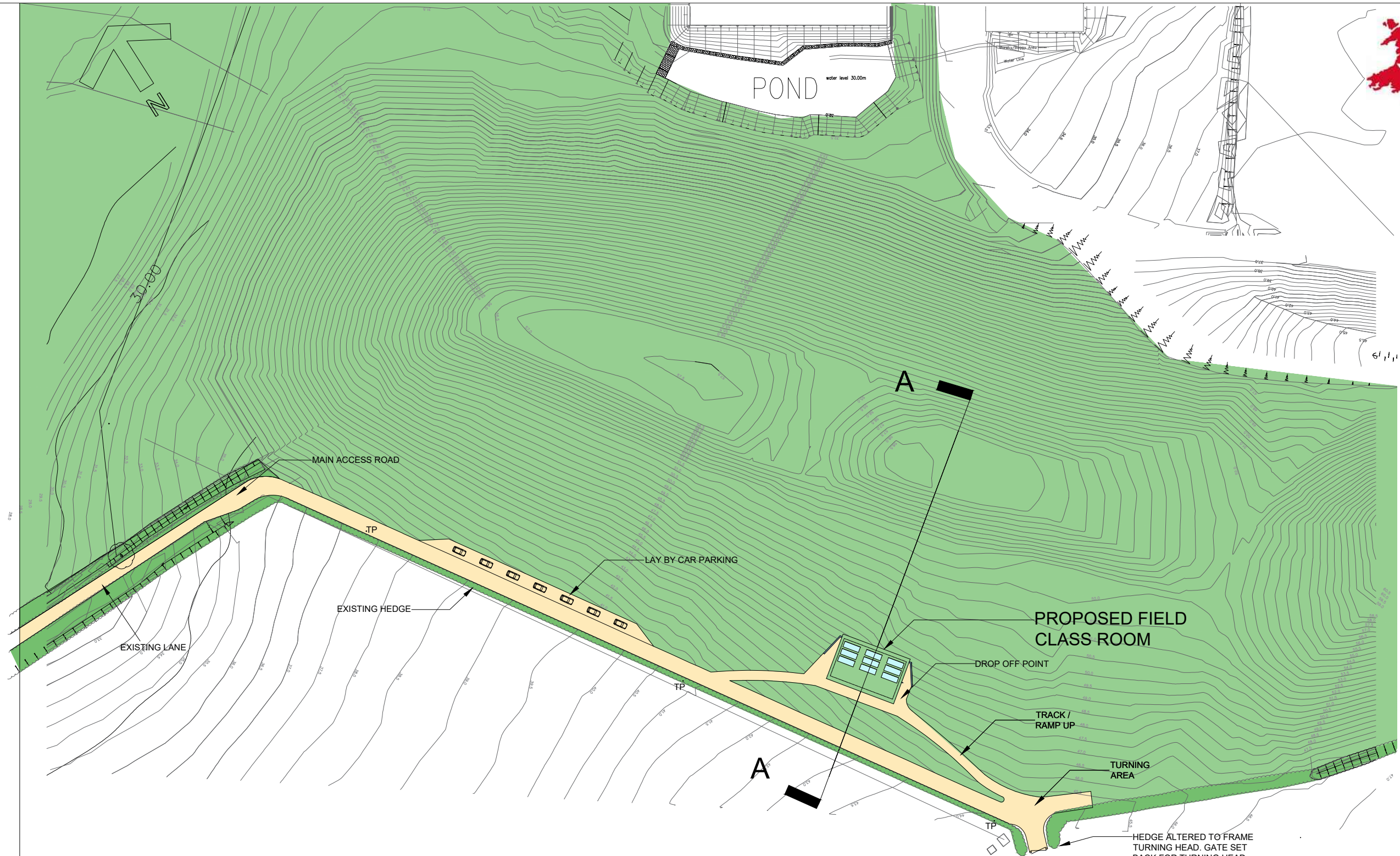
PROPOSED BLOCK SITE PLAN 1:1250